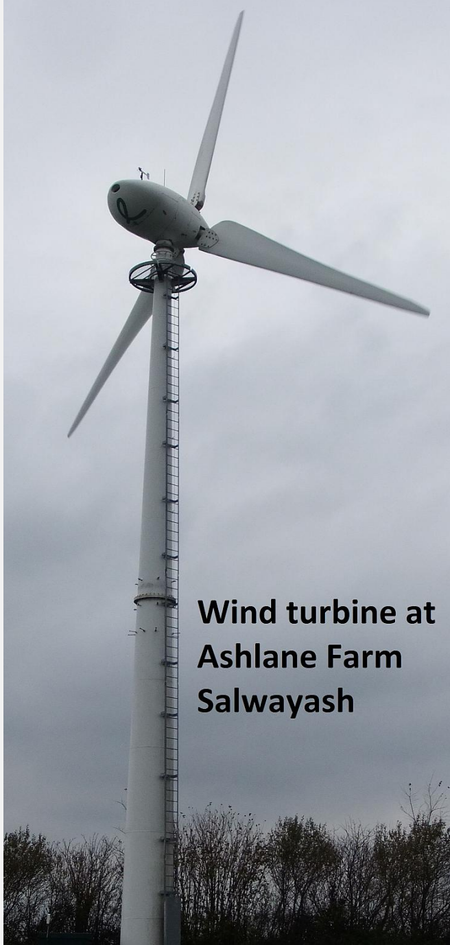
Wind turbine at Ashlane Farm Salwayash