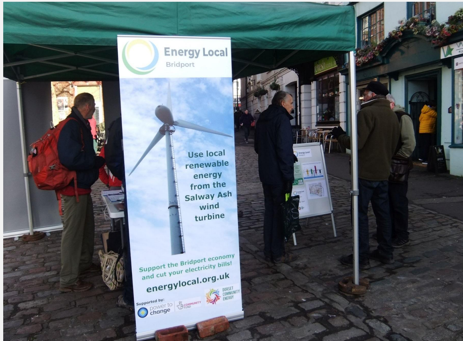
Energy Local Bridport launch January 2020